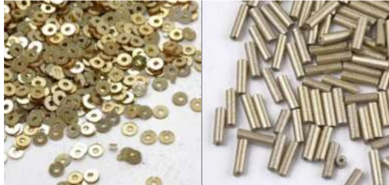
(figure4: Sequins, tube beads)