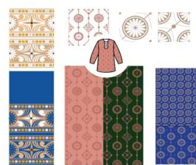
(Figure2 : patterns developed and visualization in colours with base colour)

Inspiration and colour boards (Figure 1) are developed. Extraction of intricate patterns from inspirations and making of new patterns using SCAMPER technique. Pattern/element extraction from inspirations are given in the figure.2. These extracted patterns carry antique values and majestic stories behind it, which is a cure for nostalgia. The patterns are not limited to this, there are 1000 of unique patterns can be extracted from the works of Cholas.