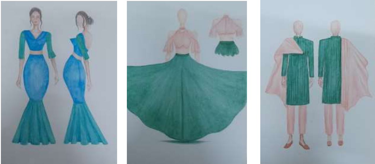
(Figure 3:final sketches with fabric colours implanting print designs can me done according to the wish of user/ clients)

Now, costume designing starts with rough sketching (brainstorming of creative ideas). Shortlist the best designs and render it with colours and all visual appearance such as fabric texture, colors, pattern placements, highlight and shadows.