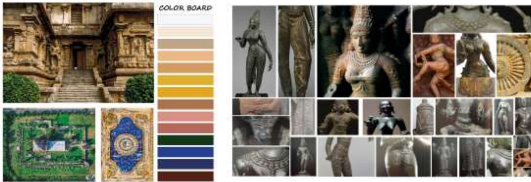
(Figure 1:Color board and inspiration board)

Inspiration and colour boards (Figure 1) are developed. Extraction of intricate patterns from inspirations and making of new patterns using SCAMPER technique. Pattern/element extraction from inspirations are given in the figure.2. These extracted patterns carry antique values and majestic stories behind it, which is a cure for nostalgia. The patterns are not limited to this, there are 1000 of unique patterns can be extracted from the works of Cholas.