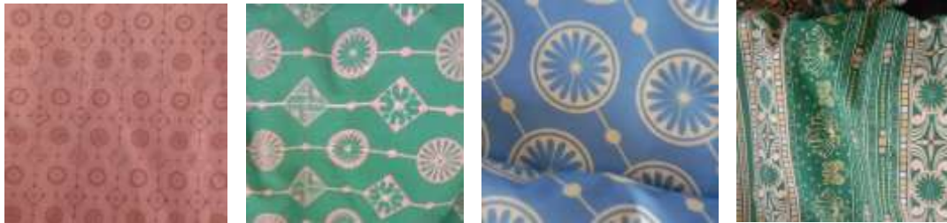
(Figure 5 :40s cotton printed Fabrics)