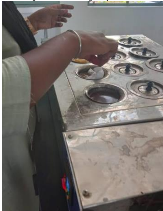
Fig.1: Premordanting in dyebath

Henna leaves was crushed into powder form. Two samples were taken. And these samples was premordanted with potash alum and copper sulphate separately. The mordants were freshly prepared by dissolving 5% in distilled water at ratio of 1:20. Now the sample gives rich brown color. The fabric were squeezed and air dried in premordanting process.