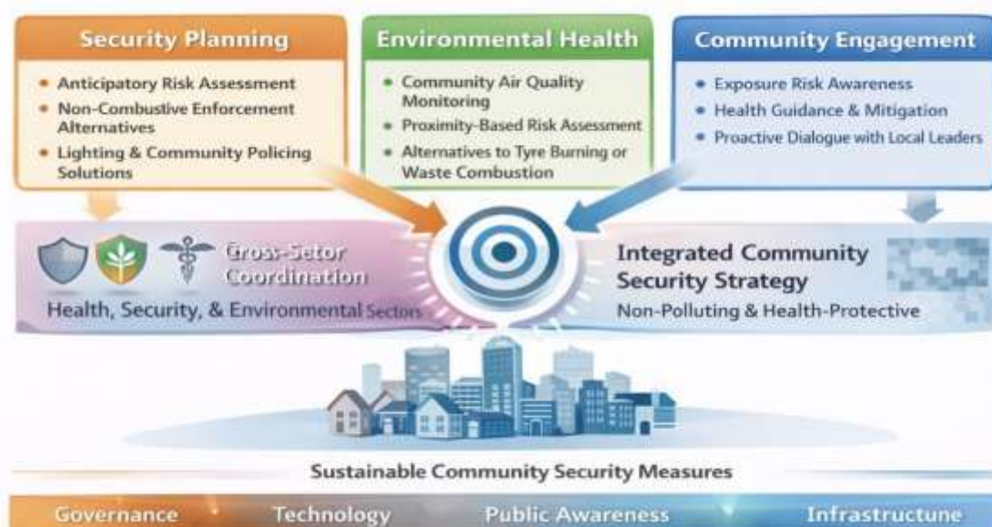
Figure 3: Integrated policy framework for managing community security without compromising indoor air quality