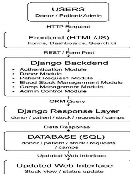
Figure: system architecture of the web app

The proposed system adopts a layered architectural design to improve modularity and scalability. It is implemented using the Django framework, following the Model–View–Template pattern. Each layer is responsible for specific operations, including user interaction, application processing, and data management. This structured design enables efficient handling of donor information, blood inventory, and request processing within a unified platform.