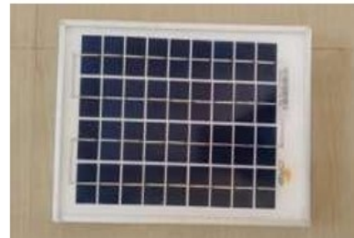
Fig:4 Solar Panel