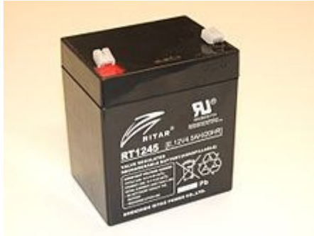
Fig: 1 Battery