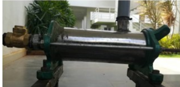
Fig: 2 Water Pump