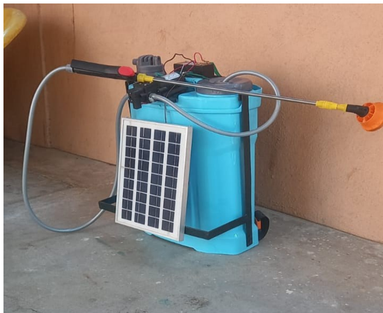
Fig5 : SOLAR POWERD SPRAYER FOR AGRICULTURE USE SETUP