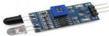
Fig.2. IR Sensor

IR detectors are little microchips with a photocell that are tuned to listen to infrared light. They are almost always used for remote control detection - every TV and DVD player has one of these in the front to listen for the IR signal from the clicker. Inside the remote control is a matching IR LED, which emits IR pulses to tell the TV to turn on, off or change channels. IR light is not visible to the human eye, which means it takes a little more work to test a setup. There are a few difference between these and say. IR detectors are specially filtered for Infrared light, they are not good at detecting visible light. On the other hand, photocells are good at detecting yellow/green visible light.