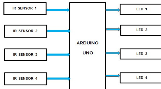
Fig.1. Block Diagram